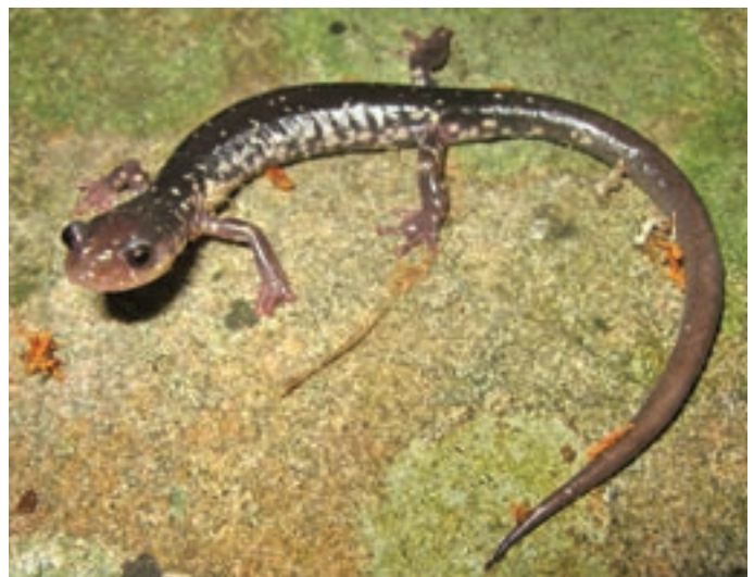
Cow Knob Salamander.